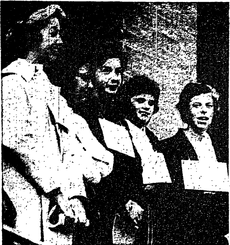
FRESHMAN CUSTOMS CONTINUE: During a moment of sunlight yesterday, a frosh "line-up" answers questions asked by upperclassmen. From the smiles on their faces, the girls apparently are enjoying this badgering.