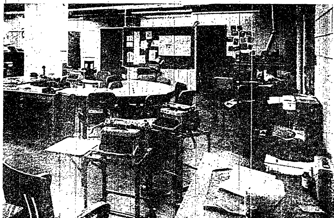
ne Daily Collegian. office should attend. e Collegian offices during the morning ner is the area as