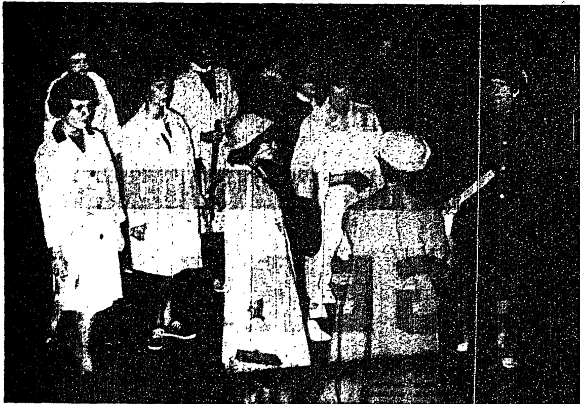
SNEAKERS AND TRENCHCOATS mark a group of freshman women apparently well-oriented to campus clothing needs by orientation leaders and junior residents. Many hat society members are serving this week in these capacities, taking new students to meetings and tours and providing answers to the mountains of questions only freshmen can ask.