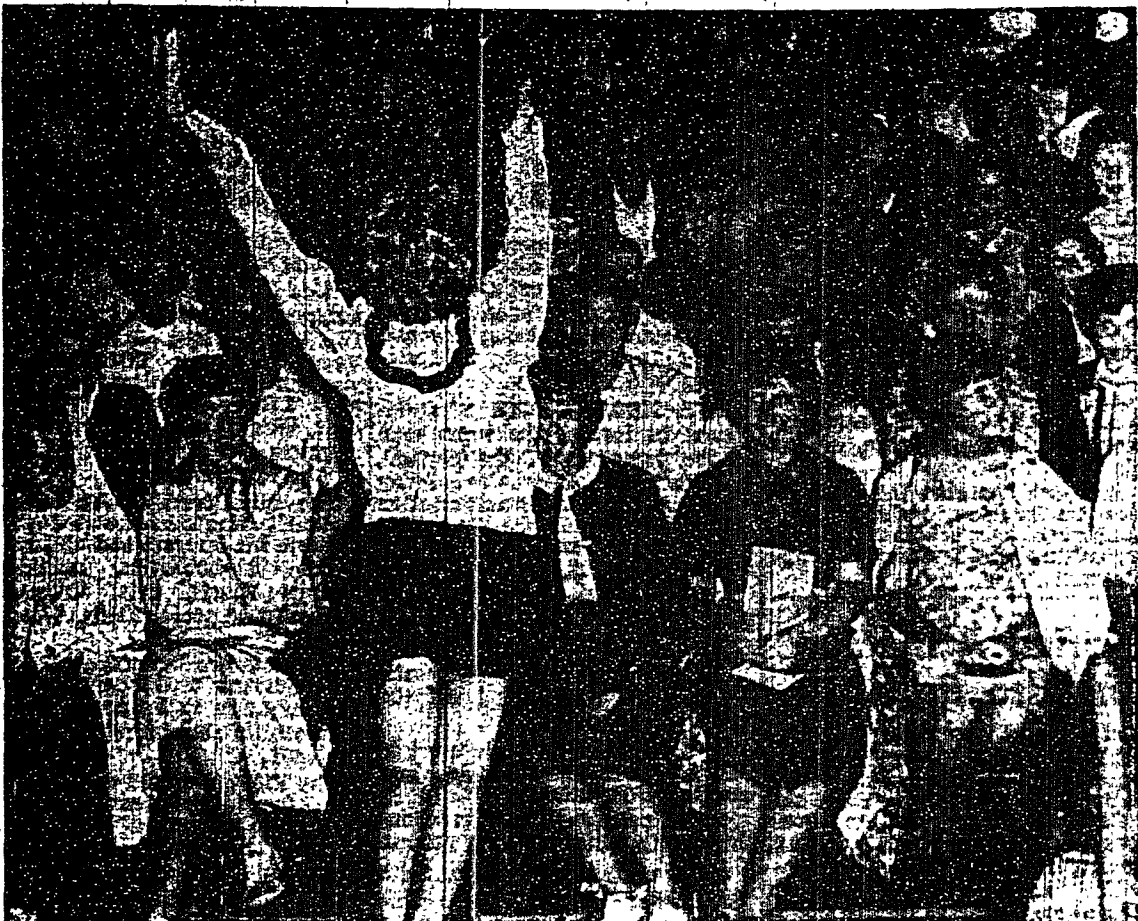
RAH TEAM —The usual enthusiasm of the freshman class was evident at the annual Orientation song and cheer fest Monday night. Even after touring the entire campus, the Class of '66 managed to shake the rafters of Recreation