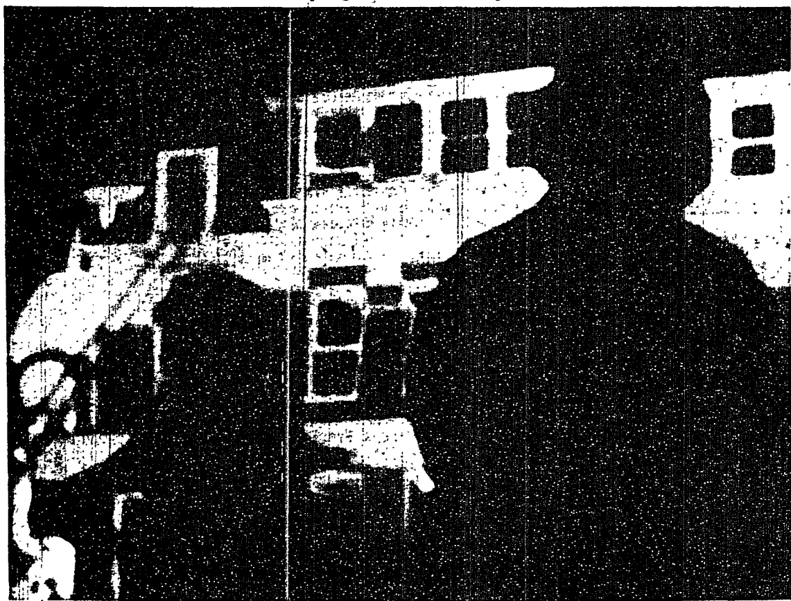
NIGHTFALL BROUGHT a reduction in the fire spectators but at least one small boy remained