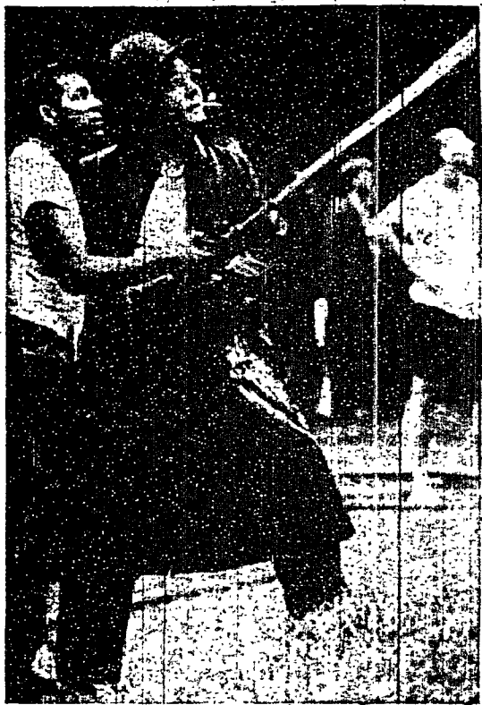
HOSES POURED gallons upon gallons of water at a stubborn Grad Hall fire Monday night as