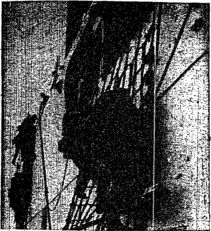
CLIMBING DOWN ROPE NETS from transport ships to landing craft in full combat uniform is a tricky operation for these Naval ROTC midshipmen. Familiarization with embarkation safety procedures is part of the amphibious training NROTC midshipmen receive during their summer program.