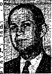
James M. Gavin

In Paris, Gavin's salary was listed at $27,500 plus $25,650 for expenses including servants and entertaining. Like other major West European capitals, the Paris job has a reputation for requiring heavy spending by an envoy beyond his government pay and independently well-to-do men have often been sent there. One official estimated the Paris ambassadorship costs around $85,000 a year, or some $30,000 above the official compensation.