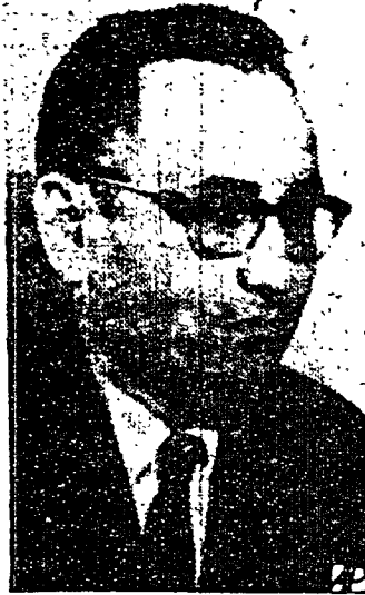
YOUSSEF BEN KHEDDA fires army heads

From his refuge in Cairo, Ben Bella showed no sign of healing