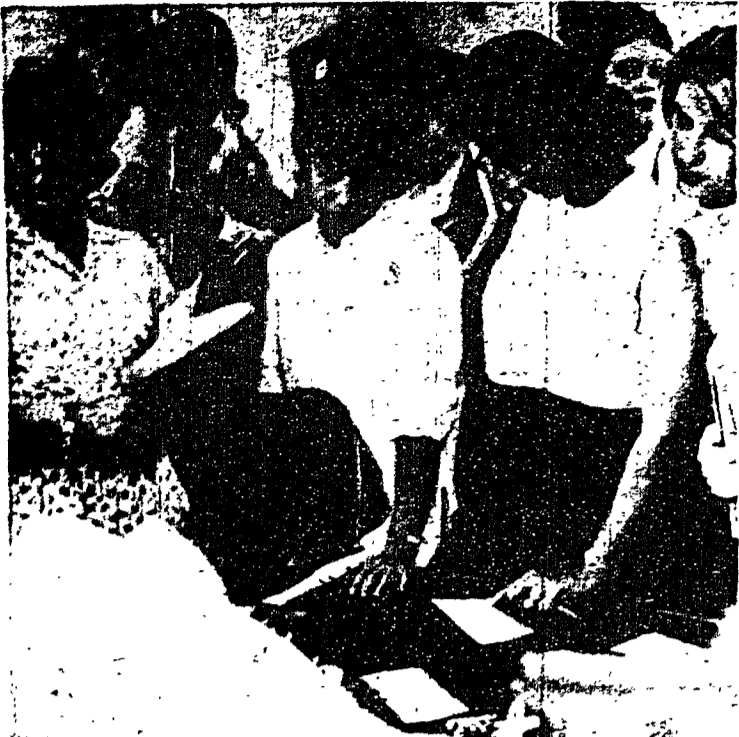
STUDENTS CROWD AROUND the tables where the plastic matriculation cards are made during registration. Large numbers of students registered for the first time and had to have identification cards made.