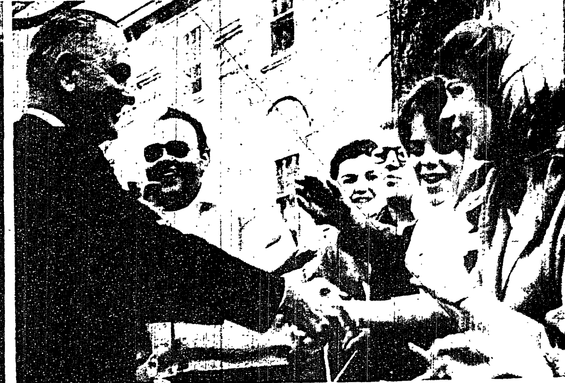
VICE PRESIDENT MEETS STUDENTS: Pausing before delivering his speech at the concluding ceremonies of the College of Business Administration Career Day, Vice President