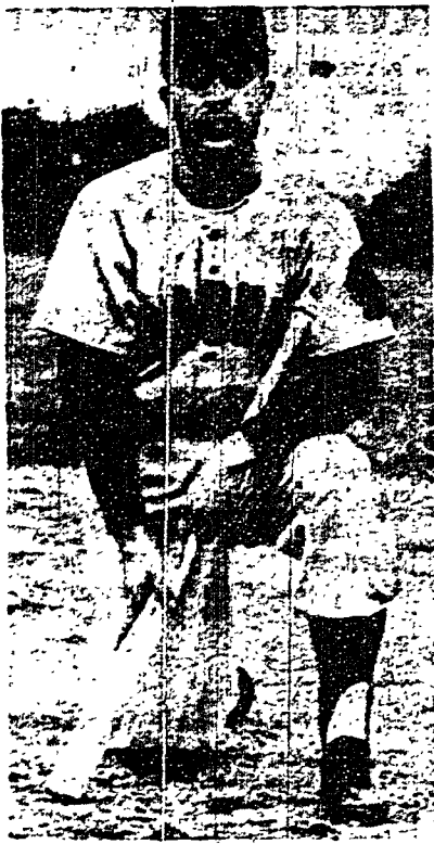
TONY MILANO ... versatile outfielder