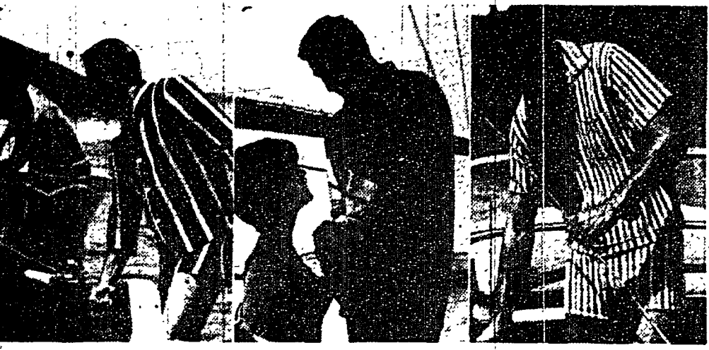
MALOLOO PENNANT STRIPE is all over print or with stripes at focal points. Orange or blue combinations in sea-worthy 100% cotton. Jackets or trader pants $6.95, trunks $3.95.

officers in the Nittany Area will. If this hapepns, each graduate college in which they majored, Mc-