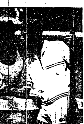
RALOLOG MIDSHIPMAN, bended with bold trim. In "white, natural, pewter or navy. Windworthy locket of 100% cotton gab 87.95. Hawelian length Lastez cord trasks of acetate, catton and rubber $6.95.