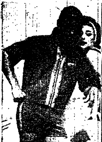
MAIOLOG DUTRIGGER Jacket of crease resistant woven cotton with guant zip and bemp bim. There's an outrigger embrodered on jacket 32.95, matching trunks $7.95. In orange, gold, lime or blue.

in swimwear created in the tradition... American as Apple Pie.