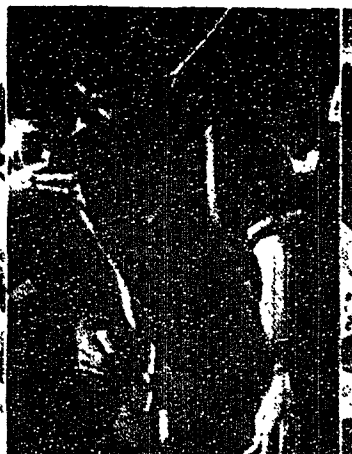
MALOLD® PORT O' CALL paintey stripe printed luxurious cotton beach shirt $6.95 over medium length cotton Hawaiian trunks $6.95. Color combinations of brown or "green to choose from.