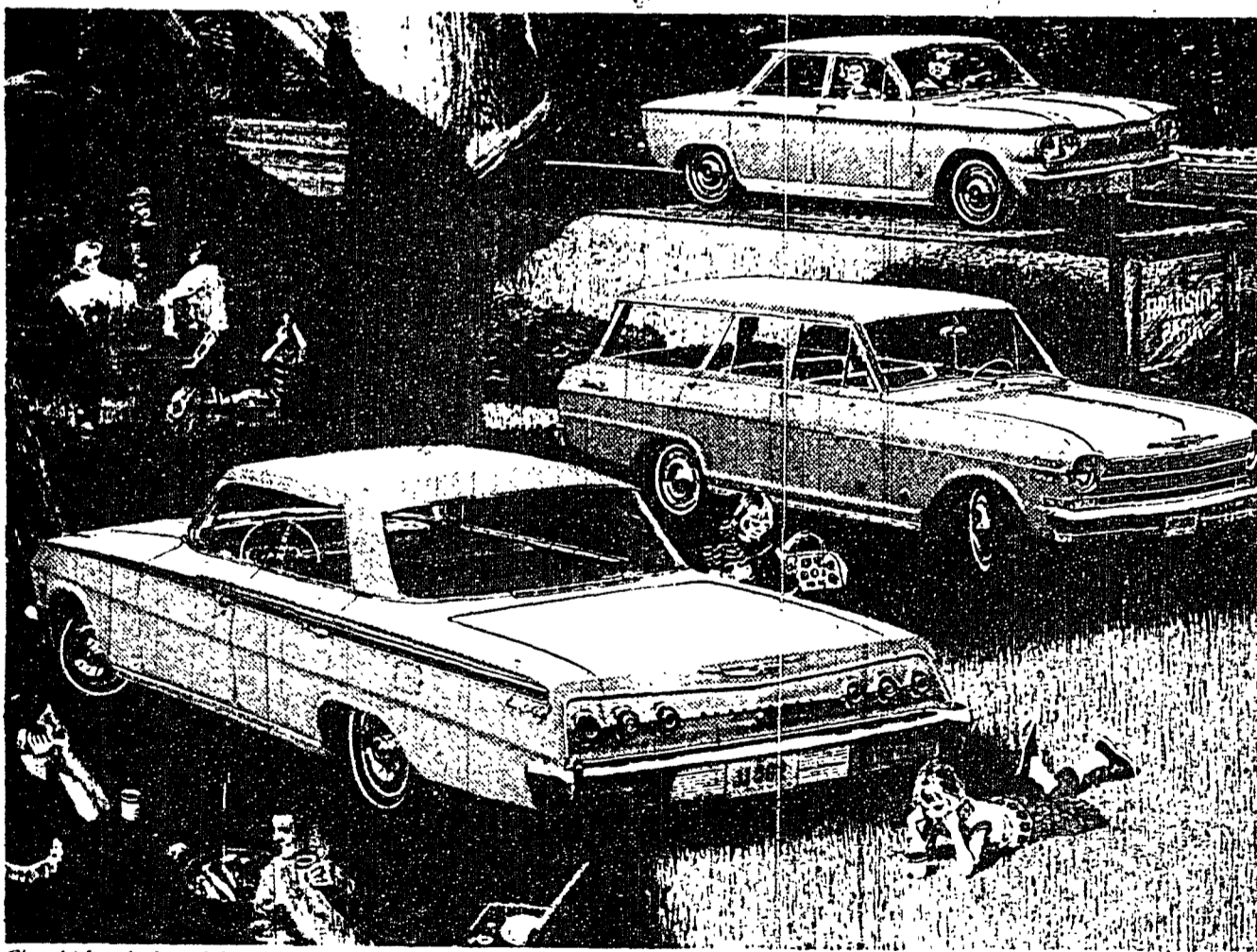
Chevrolet Impala Sport Sedan (foreground)