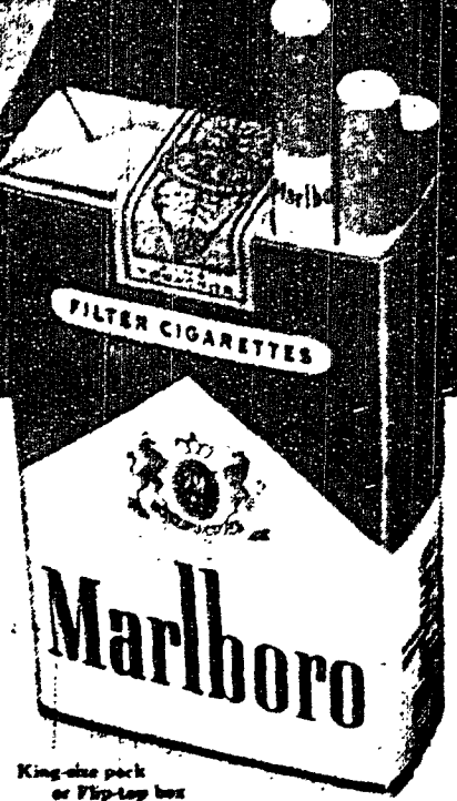
King-size pack or Flip-top box

Marlboro the filter cigarette with the unfiltered taste. You get a lot to like.