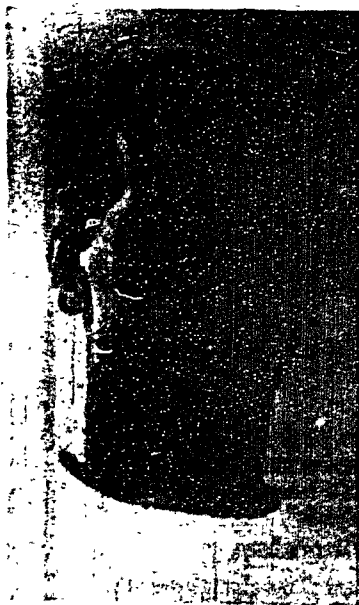
DICK SEELIG ... second with 13 goals

Rutgers and scoring three times at Syracuse.