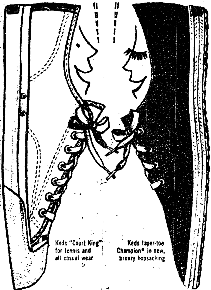
Keds "Court King" for tennis and all casual wear