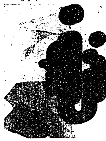
WINNING POSTER in the Ambassador tour category was made by Phi Gamma Delta fraternity and Kappa Alpha Theta sorority.