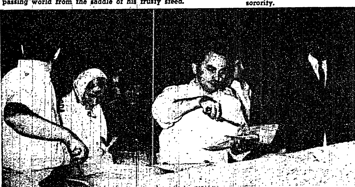
ONE HOT DOG COMING UP—No carnival is complete without a hungry crowd and vendors to supply them with food. Great quantities of