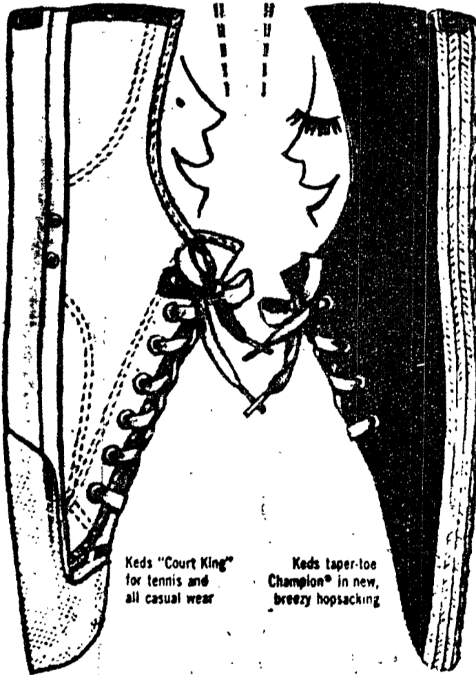
Keds "Court King" for tennis and all casual wear