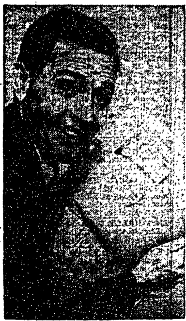
It's great news and in today's Collegian near the end.

DOUBLE EDGE RAZOR BLADES. Finest Surgical Steel, honed in oil. Full money back guarantee 25-30c 100-85c, 200-$1.50, 500-$3.30, 1000-$5.75. Postpaid. Packaged 5 blades to package, 20 packages to carton. C.O.D. orders accepted. Postcard brings general merchandise catalog. EMERSON COMPANY, 406 So. Second, Alhambra, Calif.