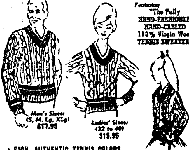
Men's Sizes (S, M, L, XL) $17.95