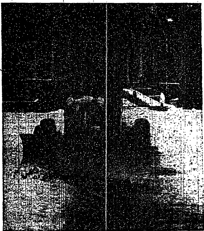
A University bulldozer gets a head start on cleaning campus snow. More snow is expected tonight.