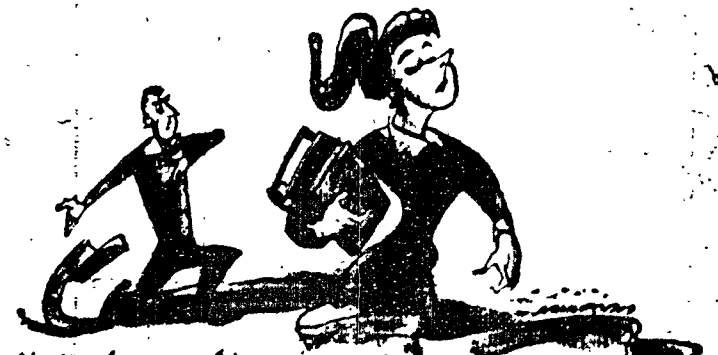
She simply could not be courted on his meager allowance.

Marlboro-less and miserable, Happy Jack tried to get more money from home. He wrote long, impassioned letters, pointing out that the modern, large-capacity girl simply could not be courted on his meager allowance. But all Jack got back from