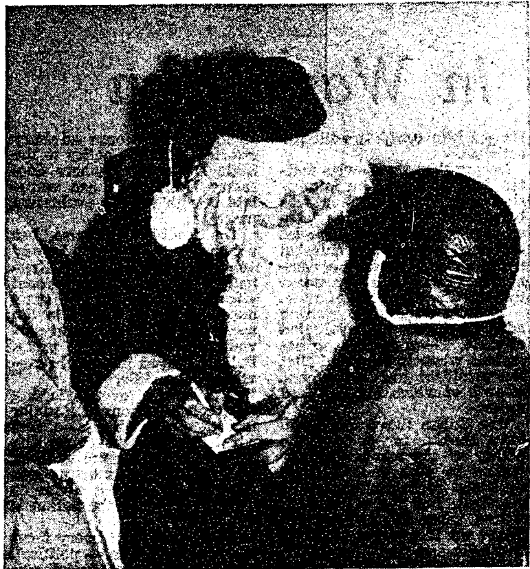
"IT'S NOT TRUE." To a young man-on-the-street, interviewed yesterday by a distinguished bearded seasonal reporter for The Daily Collegian, persistently denied reports that there is no Santa Claus. Disturbed at the rumor, the reporter is conducting a survey to discover if the statement is true.