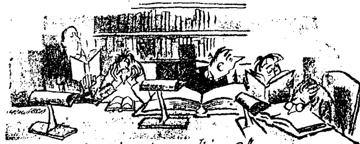
"You pinned or anything?"

Having learned that the circulation desk hasn't the least intention of ever parting with a book, let us now go into the periodical room. Here we spend hours sifting through an imposing array of magazines—magazines from all the far corners of the earth, magazines of every nature and description—but though we search diligently and well, we cannot find Mad or Playboy .