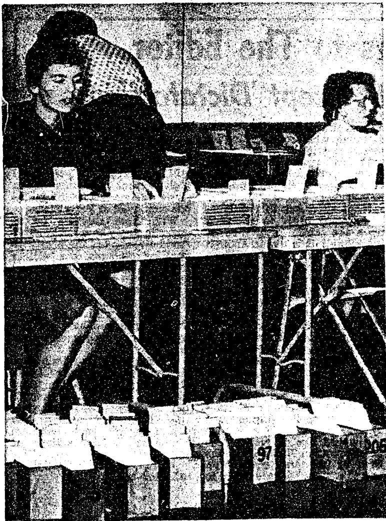
THE PUNCHED CARD GAME: The basement of Carnegie is the scene of a new campus game, pre-registration. The process, which will eliminate much of the time consuming operation in Rec Hall, involves matching students' preferences with the class schedule.