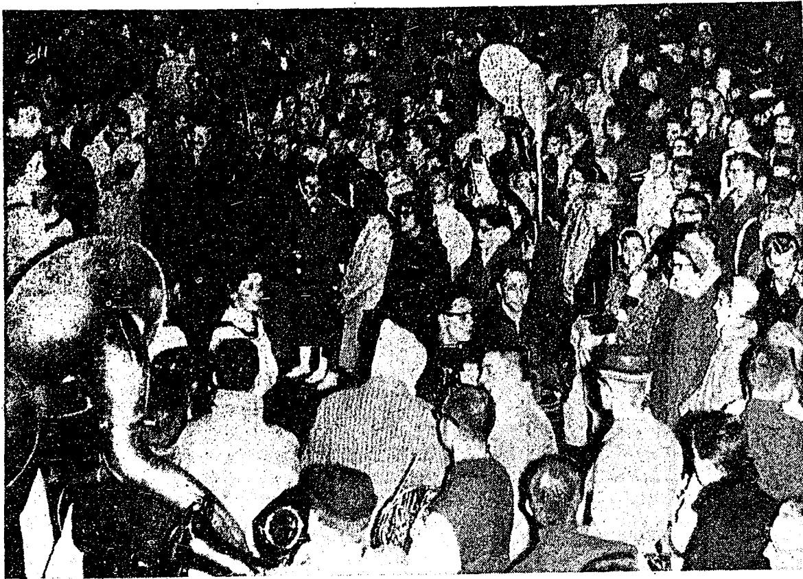
STOP THE CRUSADERS: The Blue Band, the cheerleaders and a small crowd stood in the freezing cold last night on the intramural field for the pep rally for today's Holy Cross game. The rally consisted of a few songs and cheers