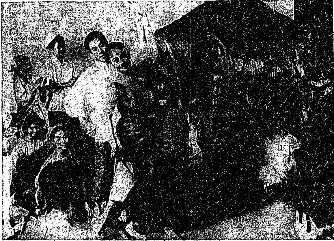
THE TINIKLING , a dance in which the performers jump in and out between rapidly clapped bamboo poles, will be part of the Bayanihan Philippine Dance Company's presentation at 8 p.m. Sunday in Recreation Hall. Authentic settings and colorful costumes will add to the program. The dance company will be presented by the University Artists' Series.

Authentic costumes and settings will add to the Artists' Series presentation of the Bayanihan Philippine Dance Company at 8 p.m. Sunday in Recreation Hall.