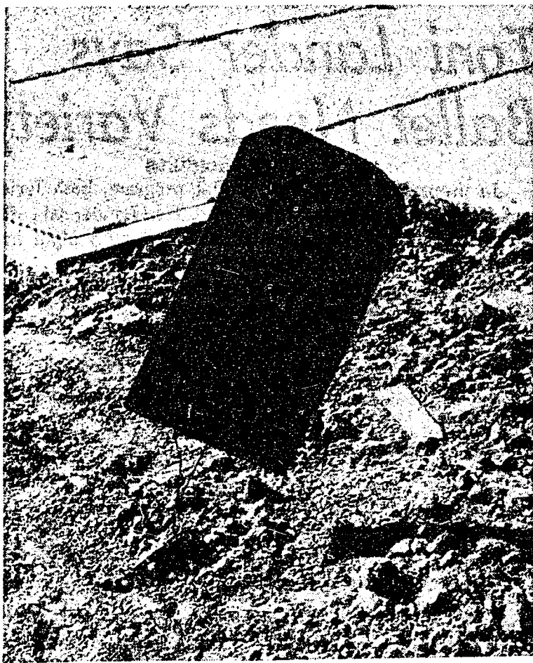
HERE LIES BIG JOHN —After University workmen had finished repairing a sewer line break over the weekend near East Halls A, this sign appeared where the hole was dug. "Big John" is the name of a popular song about a miner who was trapped in a mine after he got the rest of the miners out.

Tryouts for the "Five Finger Exercise" to be presented by the Penn State Players will be held at 7 p.m. today in the Little Theatre in the basement of Old Main.