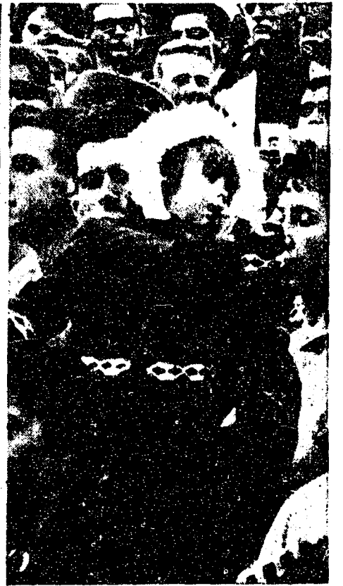
NOW I CAN SEE: Complaining that she couldn't see the game, the father of this future coed let her stand on his lap so she could cheer her favorite team on to victory.