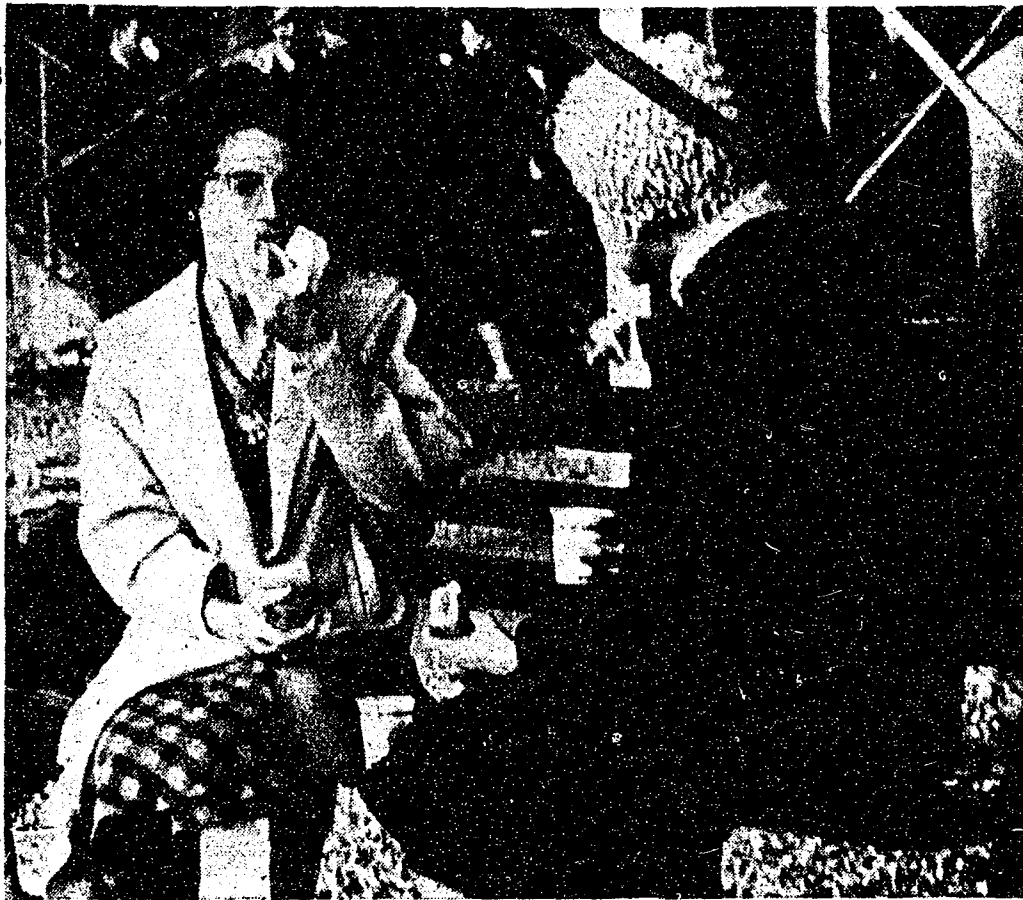
WAITING FOR THE GAME TO START: Many of the early arrivals at the game used the benches under the stands as a place to eat lunch. Hot dogs and coffee made up the meal for these two women.