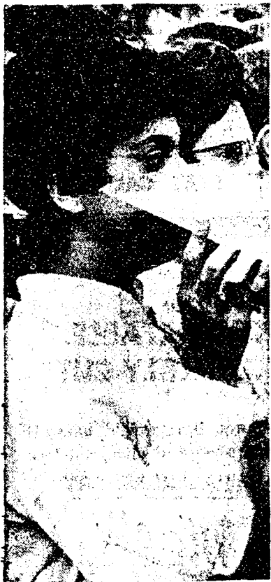
EYES ABOVE BOARD: A member of the Block "S" Club keeps her white flash card at eye level as the section did one of its many stunts on Saturday for a capacity audience and millions of TV watchers.