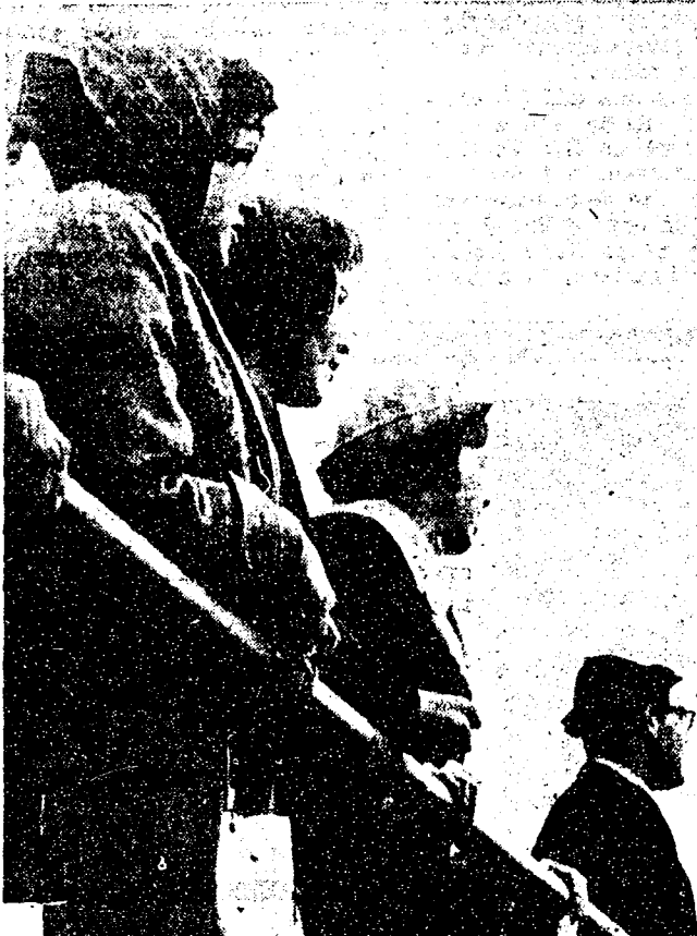
LOOK MA, I'M ON TV: While everyone was watching Saturday's game, this man in a red suit walked up and down the sidelines and in the first few rows of seats to get close-up pic-