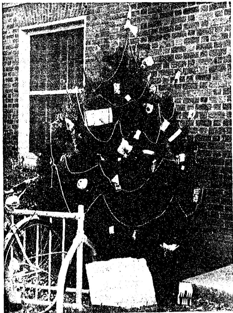
INSTANT CHRISTMAS, (Who Needs Thanksgiving Anyway?) So reads the sign under the Christmas-in-October tree "planted" by coeds in McElwain. Apparently discouraged by the prospect of turkey in the dorms, the girls decided to "brighten up" the Simmons-McElwain breezeway.