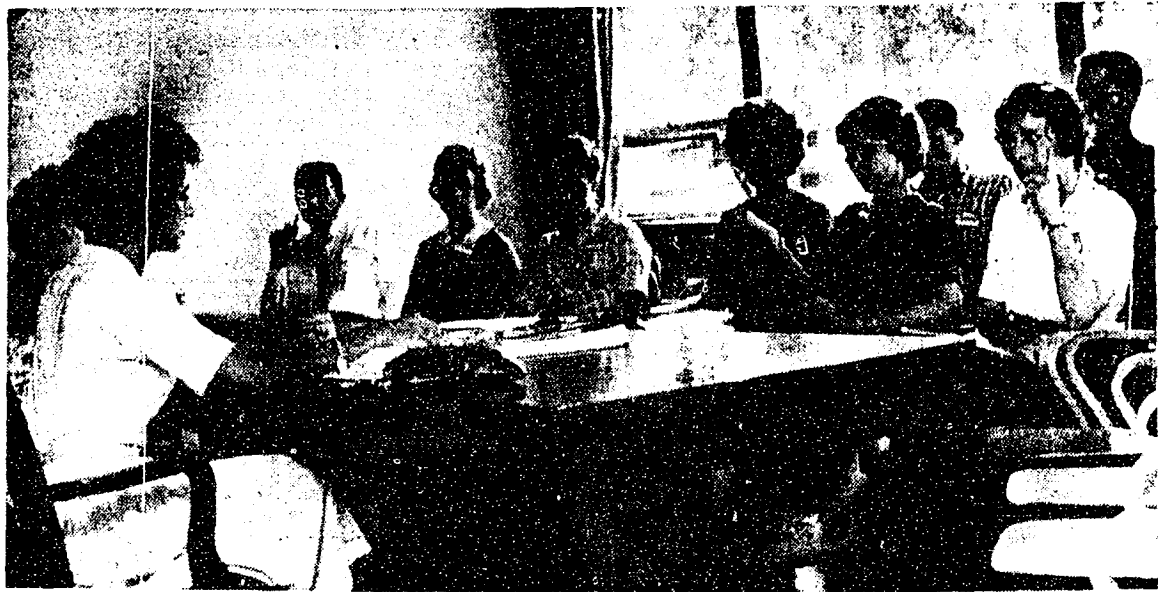
STUDENTS AND ADMINISTRATORS discuss on-campus problems in one of the six workshops of the 1961-62 Student Encampment which ended yesterday. About 125 students, faculty members and administrators attended the annual three-day Student Government Association conference. Workshops made recommendations on all aspects of student interests and made plans for the coming year in student government.