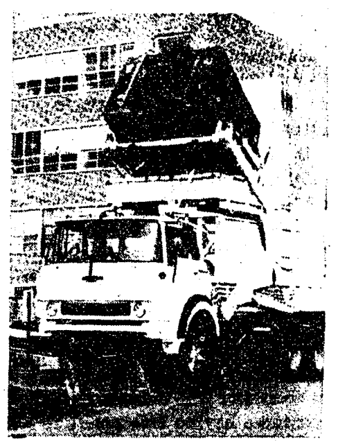
GULP!