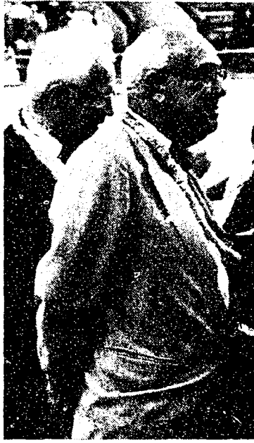
MEMBERS OF THE CLASS OF '11 stand to be recognized at the All-Class Alumni Luncheon. They were celebrating their 50th anniversary.