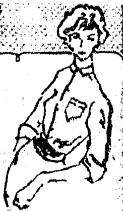
Button-down collar, roll-up sleeves