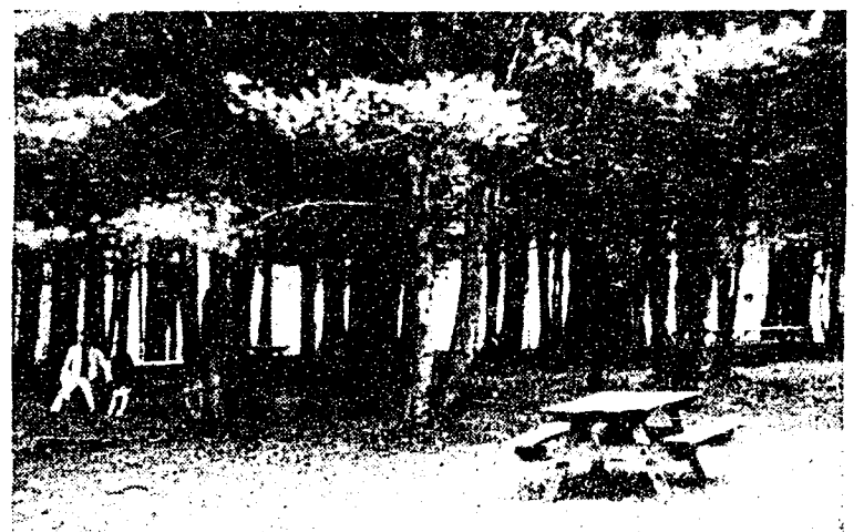
THE NEW PICNIC AREA , near the Forestry Camp, has already been used by several groups this year. Judy and Tim are resting on one of the newly made tables following their trip around the lake. The lake is in the background.