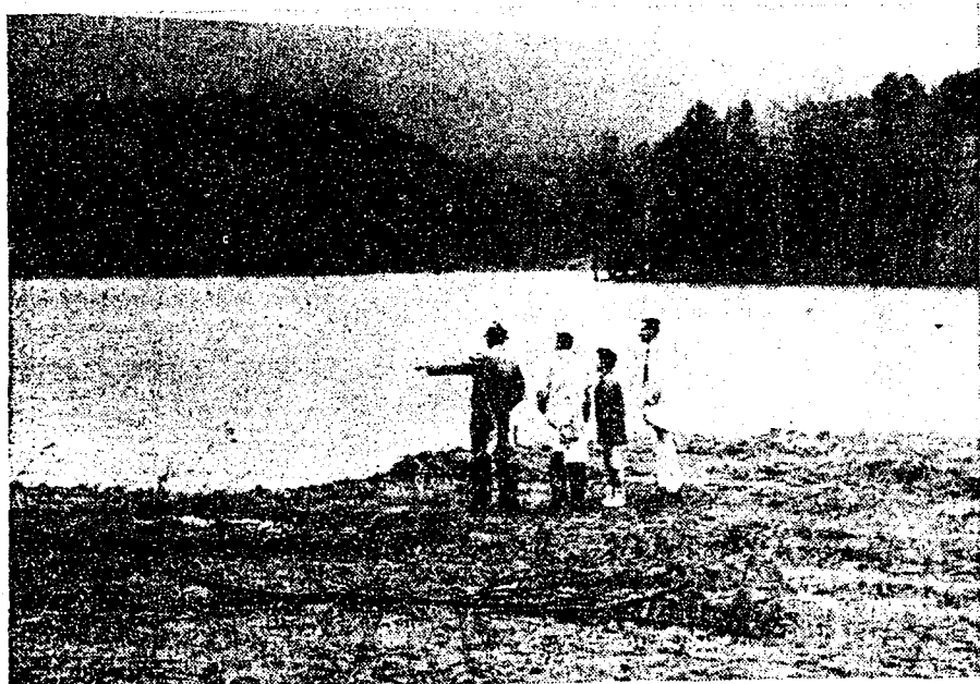
THE PROPOSED SWIMMING AREA near the Forestry Cabin is shown to the three seniors as they get to the opposite end of the lake from the boating area. Pointing out the landmarks is Robert Beam of the Alumni Funds office.