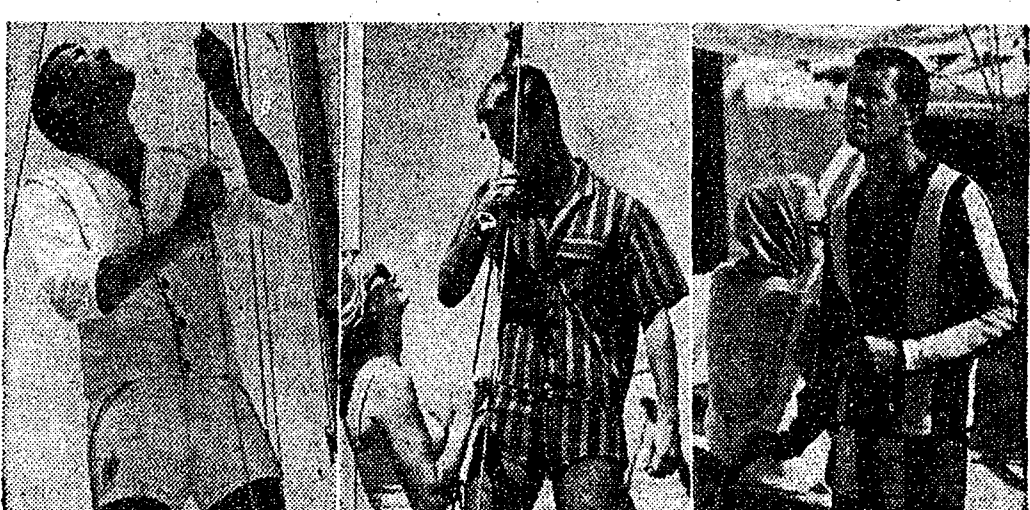
STORM WARNING 100% cotton knit. Cardigan with 3/4 length sleeves. Contrast tone trim on jacket and matching front zip Hawaiian trunks. "Storm God" embroidered on jacket pockets and trunks. Colors in white, gold or spice. Cardigan $9.95 Trunks $7.95 MALOLO LIGHT BRIGADE regimental stripe jacket with British accented collar and over-size pocket. Shell head buttons. Shown with tailored front zip trunks. Of 100% woven cotton in color combinations of gold/red or gray/green. Jacket $6.95 Trunks $4.95 COLOR GUARD blazer knit cardigan with full sleeve and button front. Shown over medium length boxer trunks. Finest 100% cotton and available in colors of gold/black or navy/red with white. Cardigan $7.95 Trunks $5.95

THE SEAFARING MAN IS a Catalina MAN (with a British accent) Mooring your craft or sunning on a raft, Catalina combines the sun and sea of California with the British style influence to brighten your seaworthy command.