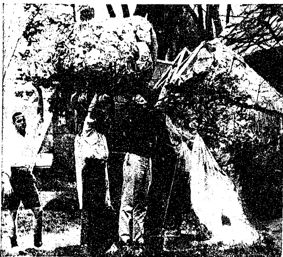
"HIS MASTER'S VOICE" is just in the beginning stages as four members of Phi Gamma Delta fraternity move part of their float in place. Kappa Alpha Theta sorority also worked on this project.