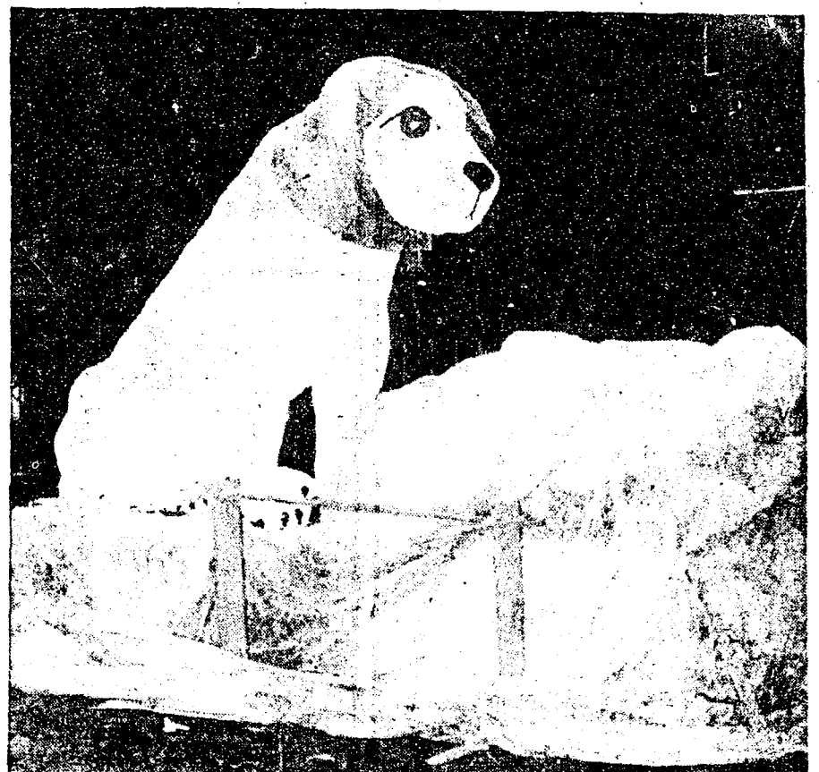
THEN THE RAINS CAME and all the groups hurriedly covered their floats to protect them. "His Master's Voice" was well protected during the downpour.