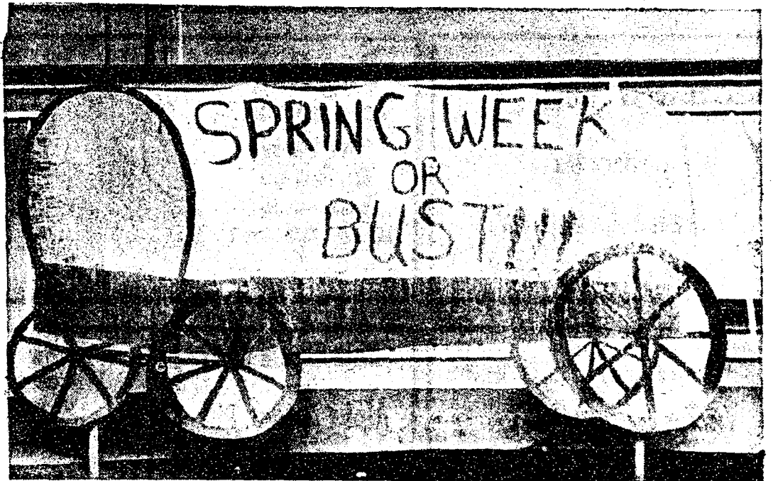
WESTWARD HO, or at least as far as the intramural field. The "Spring Week or Bust" sign on the HUB balcony is just one of many signs which advertised Spring Week.