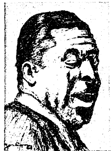
... Erroll Garner