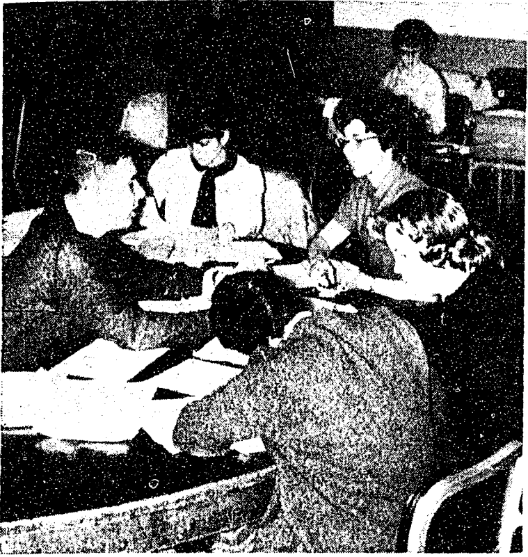
THE CITY ROOM is where most of the work for the paper is done. In the foreground is the rim where all the headlines are written.