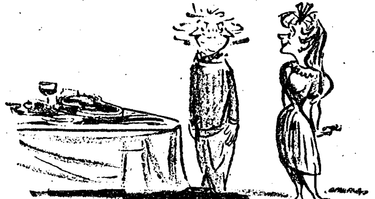
The average man today has a simple choice:

The place was Millionaires Roost, a simple country inn made of solid ivory. It was filled with beautiful ladies in backless gowns, handsome men in dickerys. Original Rembrandts adorned the walls. Marlboro trays adorned the cigarette girls. Chained to each table was a gypsy violinist.