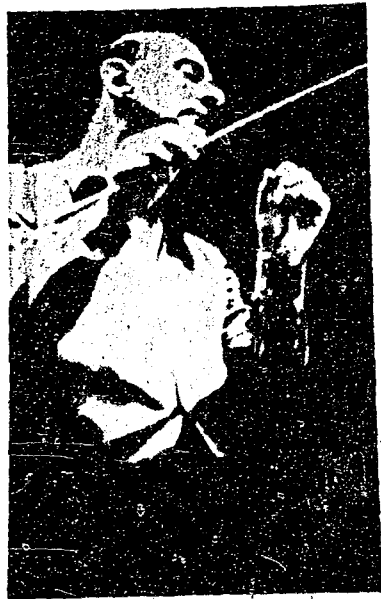
WILLIAM STEINBERG ... symphony conductor

only 15 years before the move was abandoned.