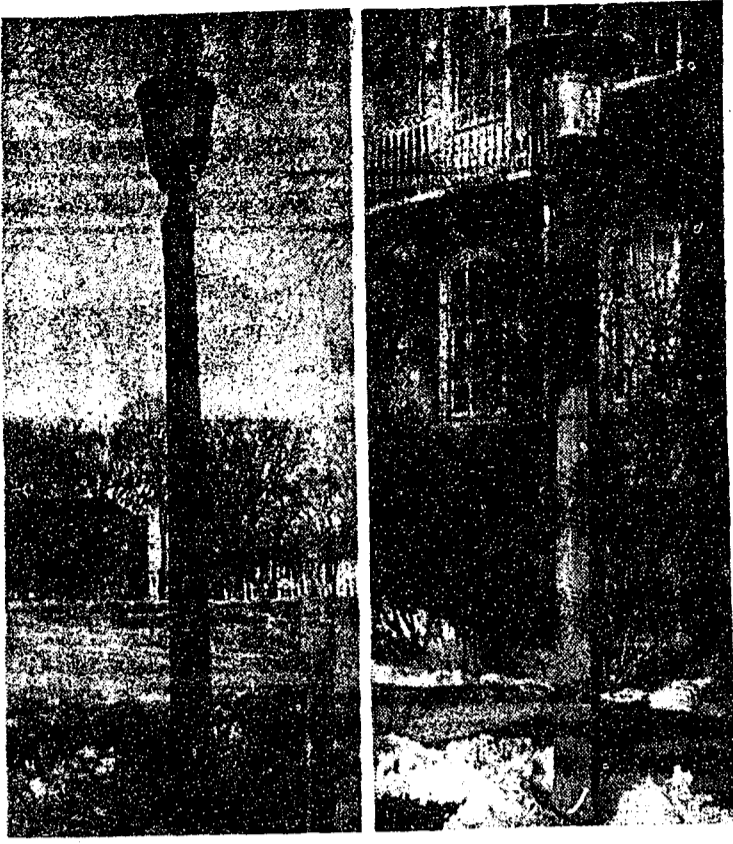
THE OLD AND THE NEW: What may be a sign of things to come is on display at the west side of Old Main. The modern light (right) is a manufacturer's sample; one of its features is that it gives more light. At left, is one of the traditional type which are all over campus.

At the meeting the West Halls Men's Area Council informed the women's council that women are permitted in the TV and study lounges in Hamilton and Thompson Halls. This had been the existing policy but the men's council felt that some girls were not aware of this fact.