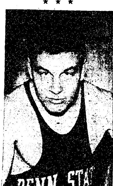
TURNER may start tonight