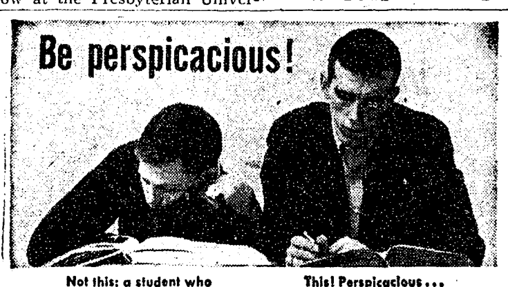
This! Perspicacious ... sharp! NöDöz keeps you awake and alert-safely!

If you find studying sometimes soporific (and who doesn't?) the word to remember is NoDoza. NoDoz alerts you with a safe and accurate amount of caffeine—the same refreshing stimulant