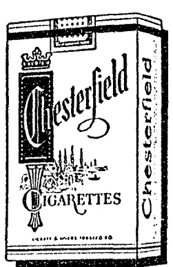
CHESTERFIELD—Now "Air-Softened", they satisfy even more! (King or Regular).