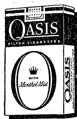
OASIS—Most refreshing taste of all. Just enough menthol... just enough!