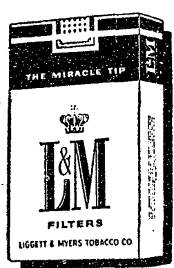
L&M has found the secret that unlocks flavor in a filter cigarette. (Pack or Box). © Liggett & Myers Tobacco Co.