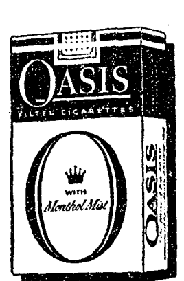
OASIS —Most refreshing taste of all. Just enough menthol ... iust enough!