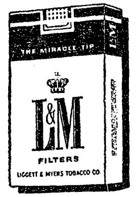
L&M has found the secret that unlocks flavor in a filter cigarette. (Pack or Box).

The more often you enter ... the more chances you have to win.