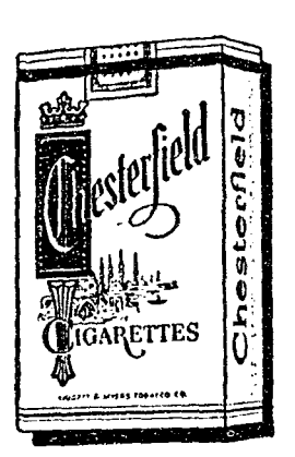
CHESTERFIELD_Now "Air-Softened", they satisfy even more! (King or Regular).