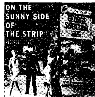
GEO. SHEARING QUINTET Here's how Hollywood's Sunset Strip stays sunny at midnight! Drume Negrita , Bernie's Tune , Jordu , 12 "live" ones. ST 1416