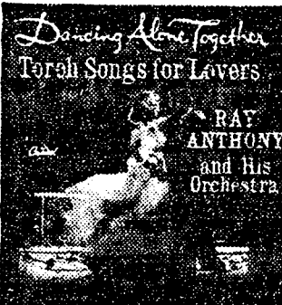
RAY ANTHONY and His Orchestra Soaring strings and a buoyant horn carry the torch songs in this album to tender peaks for lovers alone to scale. ST 1420