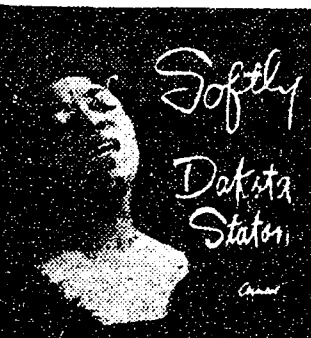
DAKOTA STATON Dakota, with Benny Carter, in twelve softly-styled standards. Body and Soul , Solitude , Close Your Eyes , Be Anybody , etc. ST 1427