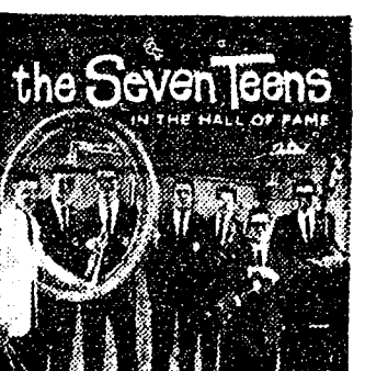
THE SEVEN TEENS Brilliant new teen-age band in swing classics like Sing, Sing, Sing , One O'Clock Jump , Little Brown Jug and Cherokee . ST 1424