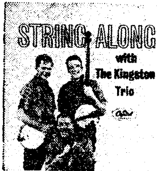
KINGSTON TRIO Great and new balladeering by the Trio. Driving Bad Man Blunder , spooky Everglades , colorful Tattooed Lady , a dozen. ST 1407