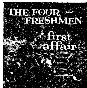
THE FOUR FRESHMEN The boys' first singing affair with oboe, flute, 6 simpatico new instruments. At Last , Long Ago and Far Away , others. ST 1378