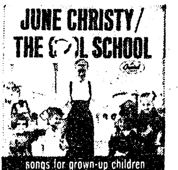
JUNE CHRISTY Cool, breezy lessons from Miss Christy. Swinging on a Star , Scarlet Ribbons , 12 in all for Small (and bigger) fry. ST 1398