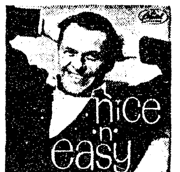
FRANK SINATRA Sinatra, the best there is, in a delightful new album. You Got My Head , Nevertheless , That Old Feeling , Dream , eight more. SW 1417