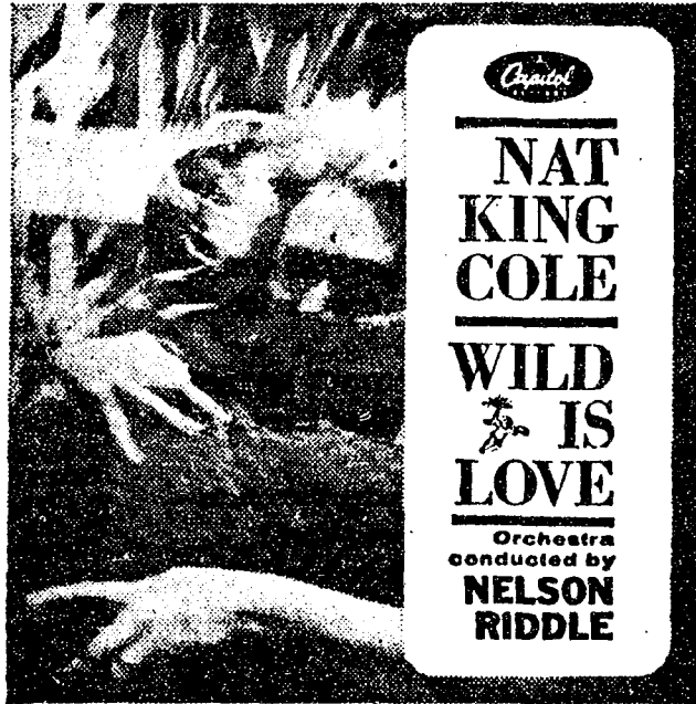
NAT COLE Nat sings as never before in "Wild Is Love," a joyful collection of brand-new ballads about the wildness and wonder of romance. Each song fits the love story told and shown in a lavish 24-pg. color booklet with the album. It's the beautifully-packaged "something else" in music that Nat and you and someone you love have always wanted. SWAK 1392

Some rather wild and wonderful new Capitol albums by Nat Cole, the Kingston Trio, Sinatra and others