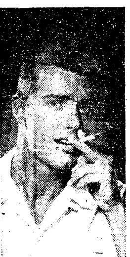
Tried Other Menthol Cigarettes?