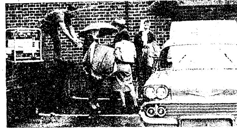
PENN STATE'S SPECIAL PROBLEMS, the traffic and rain were very much in evidence on Orientation Sunday. This is the first Orientation Sunday it has rained in 10 years.