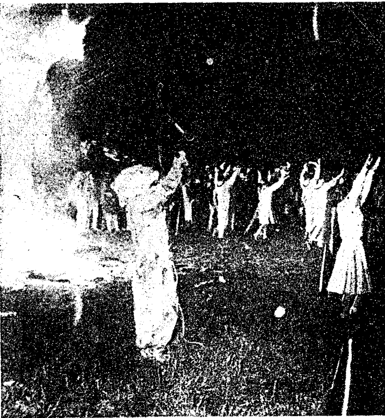
HAIL TO THE LION —Pep rallies lend to the spirit of the football season. This one took place before the Syracuse game last year. Freshmen will get a chance to try out their cheering on Thursday evening.