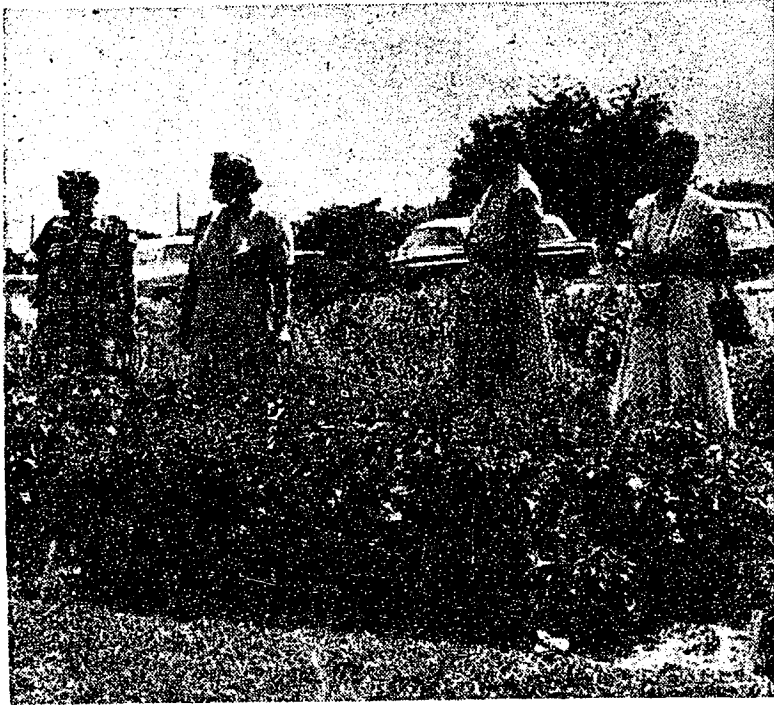
VISITORS make trip through blooming University flower gardens, which have been popular attractions on weekends.

She has a scholastic average of 3.94 and has been previously cited with a Chemistry Achievement Award, as an Evan Pugh Scholar, and as a Motar Board Scholar.